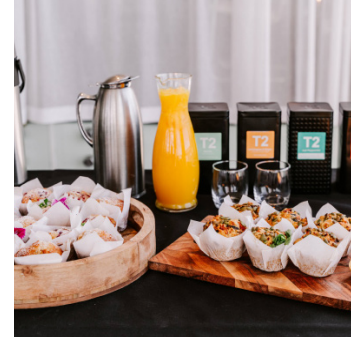
Terms & Conditions apply for all menus. Please check with your Event Coordinator for the full menus.