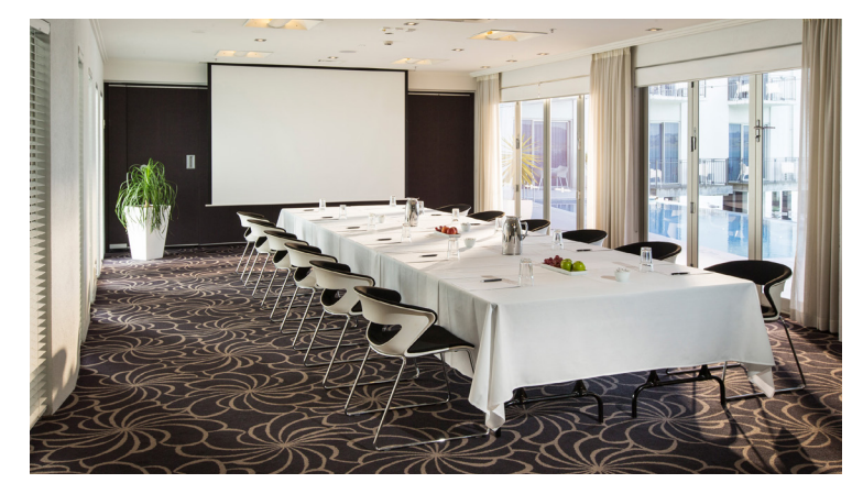
↓ POOL HOUSE II